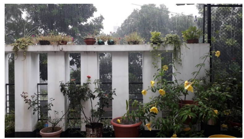
Figure 01- Single Residence, Aram Housing, Bosila